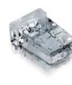
Half Dice Cube - 6 g 11 x 23 x 26 mm