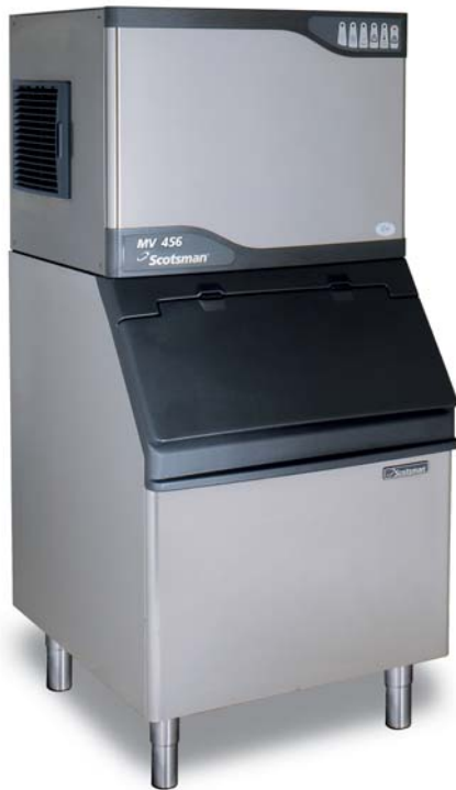
MV 456 with B393 (sold separately)