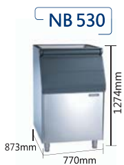
Storage Capacity: 243kg