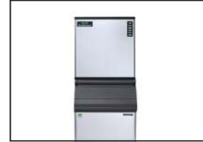
SUS304 Stainless Steel Panels