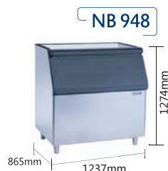
Storage Capacity: 406kg