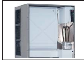
Vertical Cube System