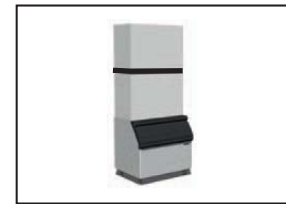
Double Stack (Needs a stacking kit sold separately)