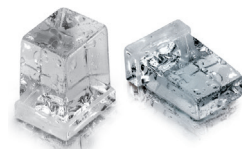
Full Cube - 12g (26.5 x 26.5 x 26 mm)