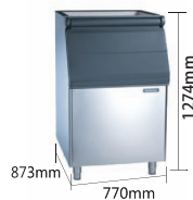
Storage Capacity: 243kg