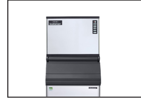
T304 Stainless Steel Panels