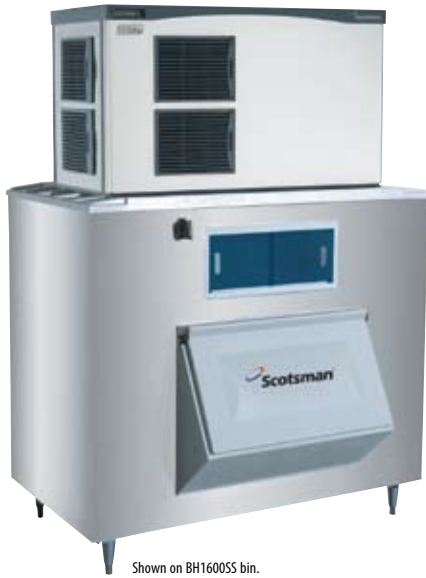
Shown on BH1600SS bin.