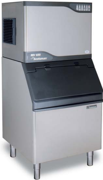
MV 606 with B393 (sold separately)