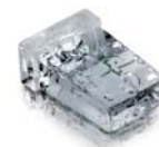
Half Dice Cube - 6 g 11 x 23 x 26 mm