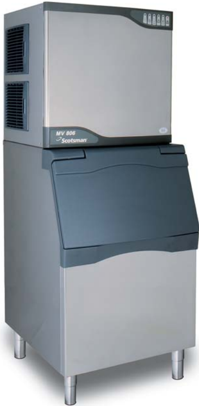
MV 806 with B530 (sold separately)