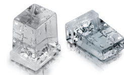
Full Cube - 12g (26.5 x 26.5 x 26 mm) Half Cube - 6g (13 x 26.5 x 26 mm)