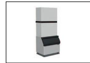
Double Stack (Needs a stacking kit sold separately)