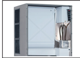
Vertical Cube System