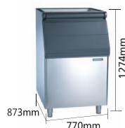
Storage Capacity: 243kg