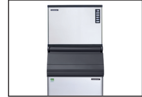
T304 Stainless Steel Panels