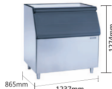
Storage Capacity: 406kg