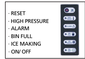
Auto-alert Indicator Lights