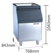
Storage Capacity: 178kg